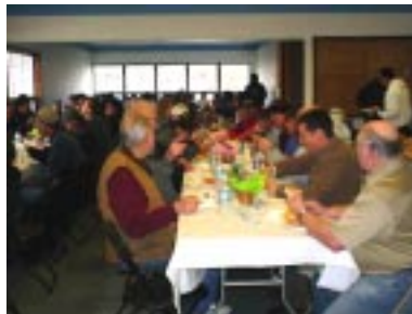
Check out the crowd. The place was packed!