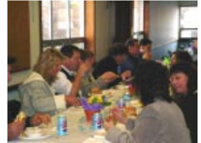
Everyone enjoyed the great meal.