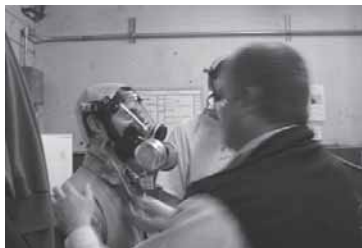
Now, which one of these two fellas passed certification?