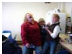
Well, maybe more than a little.....