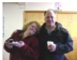
There's a little snugglin going on.