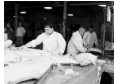
Fresh halibut continues to arrive from Alaska. BCS crews head, size and grade the halibut brought in by the 'Pelican' for fresh shipment.