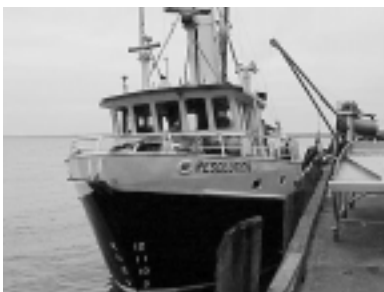
Fishing boat 'Resolution' at the BCS Ice Dock.