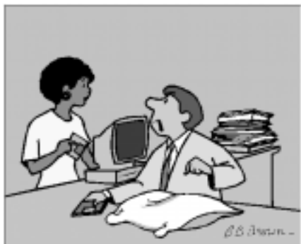
"This is the software for my head."

I guess I'll stick to my pad and paper And the memory in my head