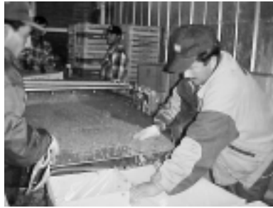
Clark's Berry Farm has been freezing I.Q.F. raspberries in the old bean tunnel area.