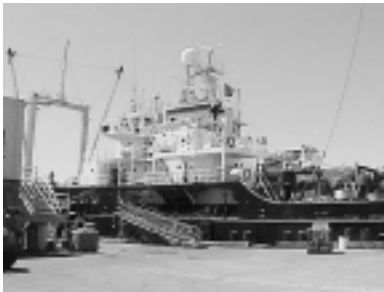
The 'Excellence' at West Dock.