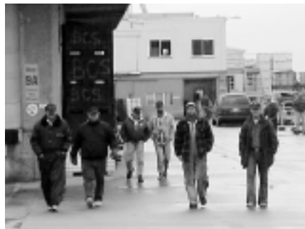
West Dock evacuates

BCS successfully completed the “sweep” of all buildings and evacuated occupants within 4 ½ minutes from start to finish. Everyone was back safely to work in less than 10 minutes. BCS promotes and practices safety for all employees and appreciates your part in the seriousness of such practice drills. Good job everyone!