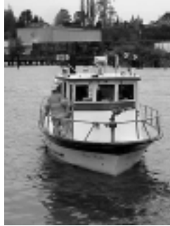
The BFD's Fire Belle

The Fire Department chose Dock 4 for the simulation of an “under the dock” fire. This site was chosen to test several new nozzles and pier-side hydrants. The excitement was heightened with the arrival of the BFD's fire boat called the “Fire Belle”. The fire boat participated in the drill by spraying water up under the dock. The BFD was impressed by BCS's quick response and coordination. Everyone involved rose to the challenge, and many lessons were learned (for example, Brad Flinn now knows to check the wind direction before evacuating his team!).