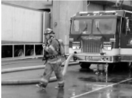
Engine 51 hooks up to the hydrant

On October 24th and October 25th, BCS teamed up with the Bellingham Fire Department (BFD) to provide training for our main plant crew as well as new trainees from the BFD. Both the day and night shift crew took part in the mock fire emergency.