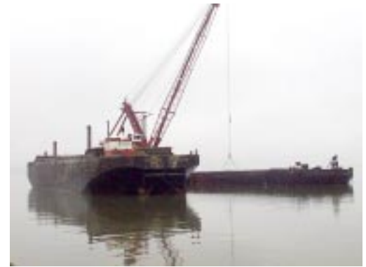
Dredging in the fog.

From January 5th through 20th, visitors to BCS could see a large floating crane dredging the shipping channel along BCS's dock. This federal dredging project was contracted by the US Army Corps of Engineers, who hired Manson Construction to do the actual work.