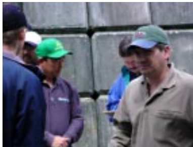
Scribe reviews drill plan.