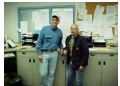
The General and the Colonel.