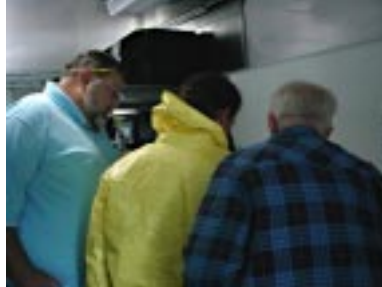
Command site making decisions.