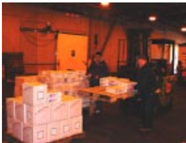
Raul Morales and Bruce Berg set up cruise line orders.