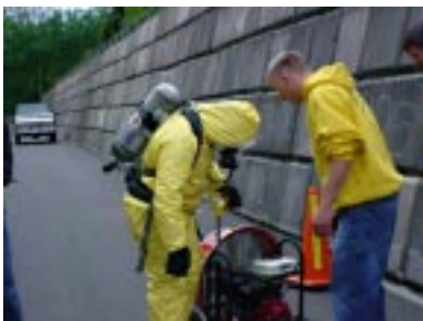
Proper direction of fan.