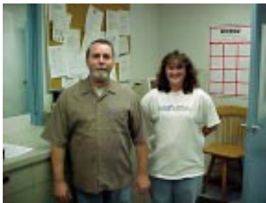
The Cruise Line Coordinators.