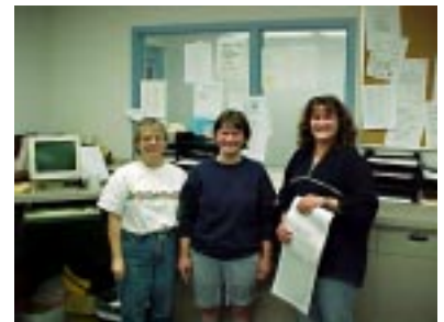
The Orchard A Team.