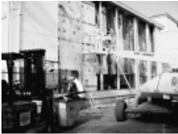
Renovating the 5-ton tunnel.