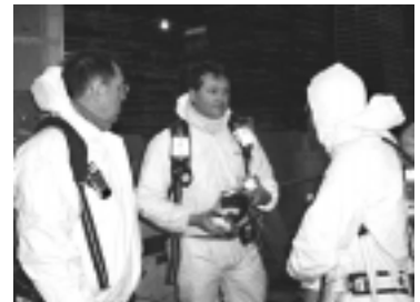
The Engineers suit up for ammonia safety training.