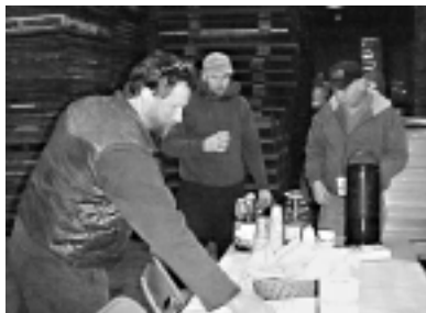
You're busted, Jack! No eating treats until after the test!