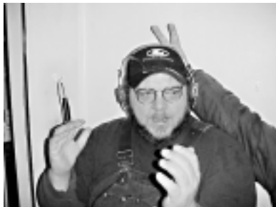
Hey Carl, I think I'm picking up some aliens!