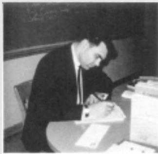
He was a teacher of English, Speech, Drama and Driver's Ed for 28 years at Nooksack High School. He now works for BCS. Yahoo! This photo was taken in 1967. Answer on page 2.